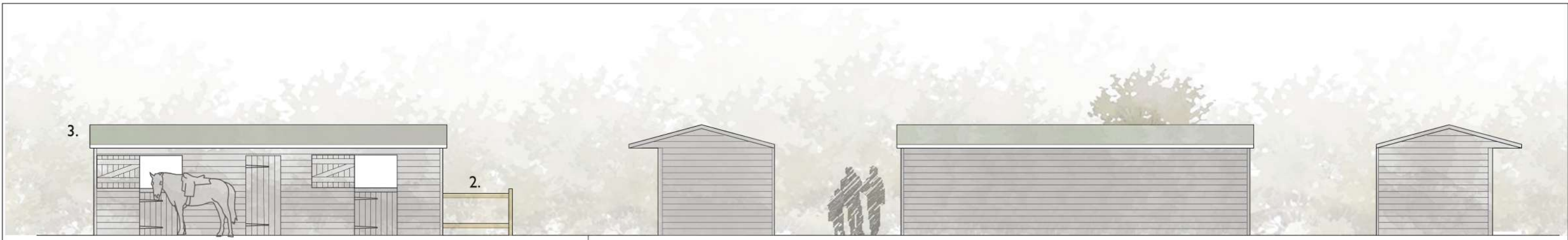
North West Elevation - Scale 1:100