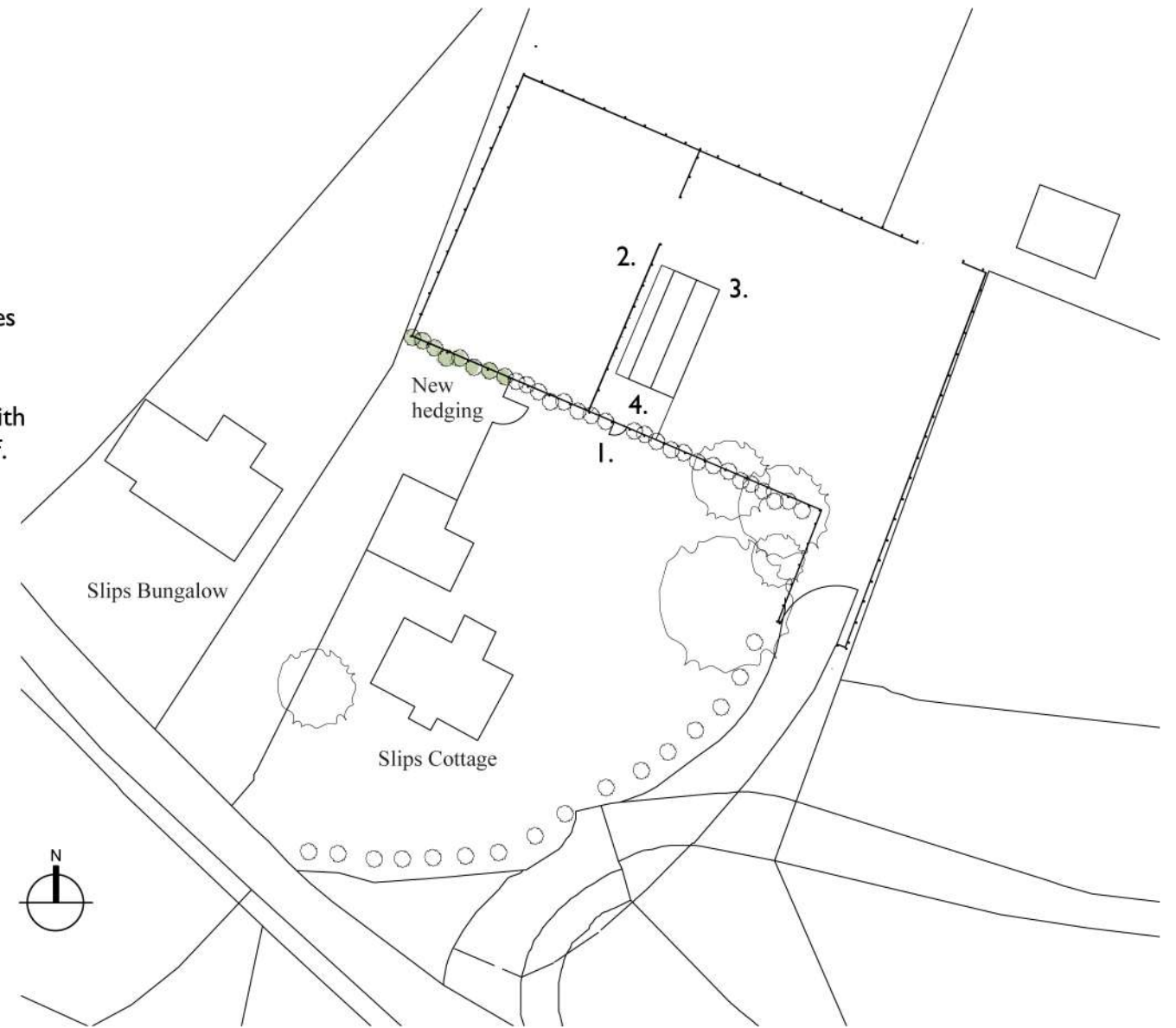
Proposed Block Plan - Scale 1:500